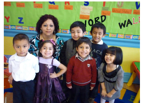
Lutheran School's Week -Dress -up Day