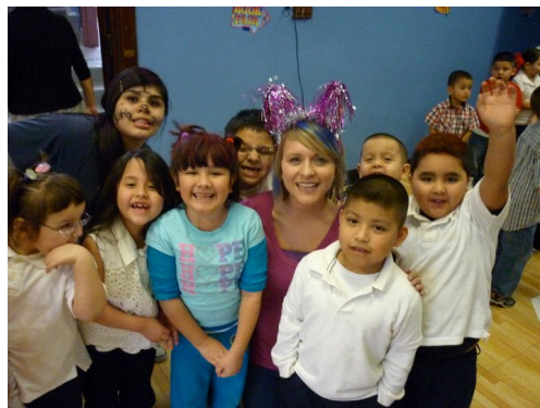
Lutheran School's Week -Crazy Hair Day