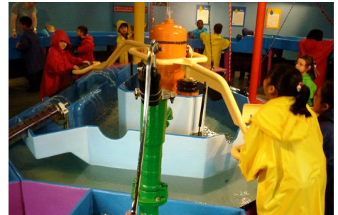
Learning about the properties of water at the Chicago Children's Museum.