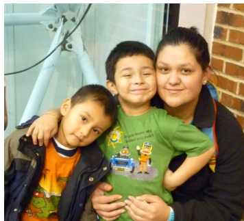
Smiling for the camera on a recent field trip.

We currently have 695 labels collected for the 2010-2011 school year!