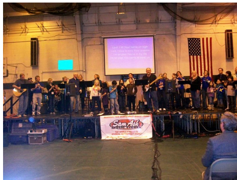
The grand finale, featuring Grace Students and members of ALL the bands playing and singing together!

Look for another praise band event in 2012!