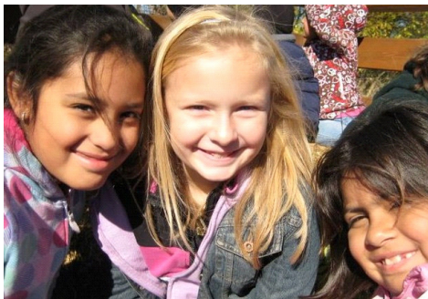
Pumpkin farm field trip